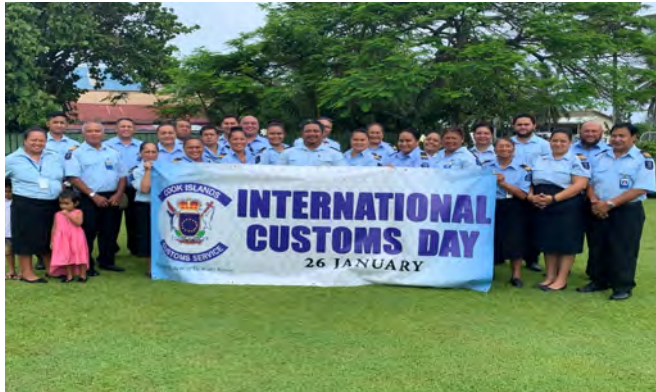
Cook Island Customs celebrates ICD

On 26 January, 2020 OCO members joined Customs Administrations around the world and celebrated this years International Customs Day on the 25th of January 2020. This years theme for International Customs Day 2020 is "Customs fostering Sustainability for People, Prosperity and the Planet"