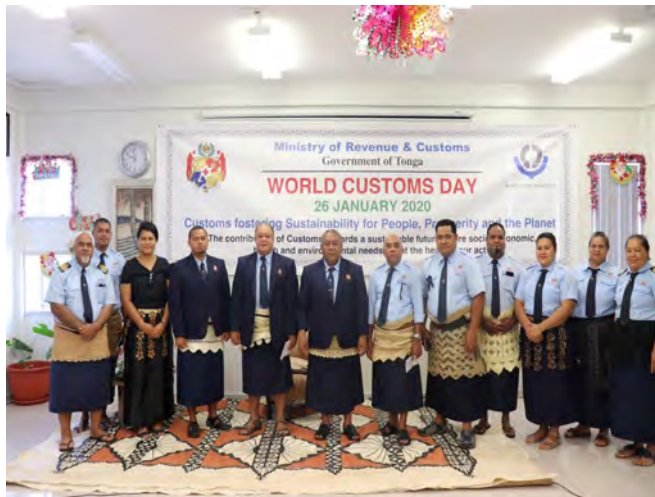
ICD Celebrations in Tonga