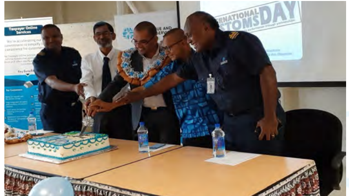
ICD Celebrations in Fiji