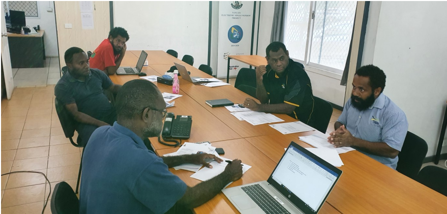
VeSW and TRBR Officials begin discussions on the Type Approval module on 2nd March 2022

The standard practice of developing new Computer systems or system modules, is that there has to be a clear understanding of the procedures and requirements of the user prior to actually developing the automated system. This has been the standard practice at the VeSW for all the system modules that have been developed and deployed in Vanuatu.