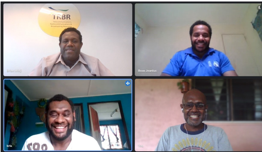
Online validation session with the Regulator on 25th March 2022

The SRS has now been sent of to the system Developers in UNCTAD to work on the module prototype. UNCTAD has indicated that development will begin on the prototype in April and will be later deployed for testing, trainings and implementation.