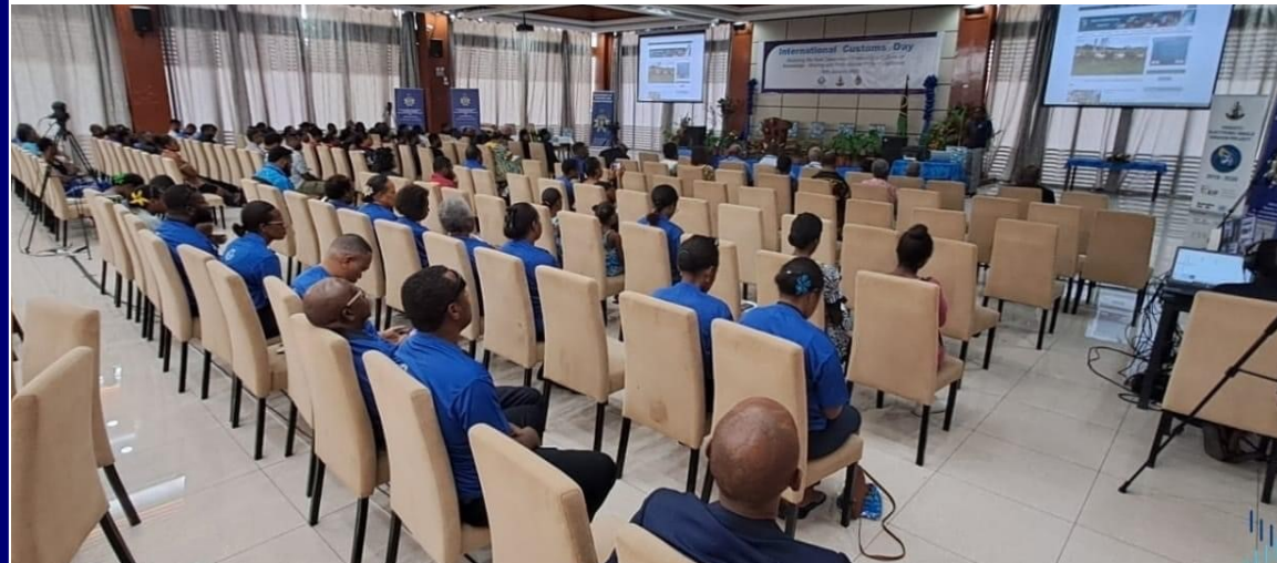
The event was attended by both the Government and invited guests. It was also streamed live to a global audience.