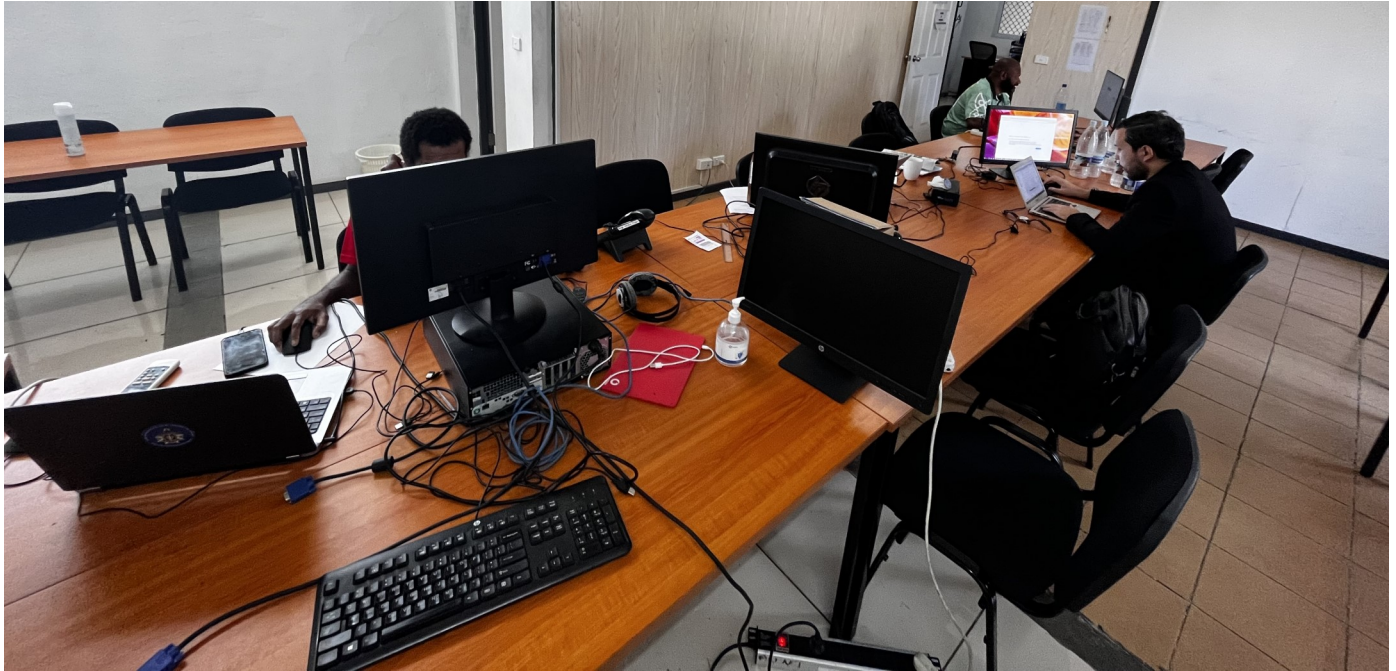
Behind the scenes: The National Project Team (NPT) working with the ASYCUDA expert to restore the VeSW system

Following the recent cyberattack on the Government systems, the VeSW system was offline since 6th of November 2022. It took over a month to bring the VeSW servers back online on 9th December, thanks to the hard working teams at the Project and OGCIO (Gov. ICT team). Another few weeks was required to open up secured communication lines between the users and the system, before users were able to connect to the system again on 1st of January 2023!